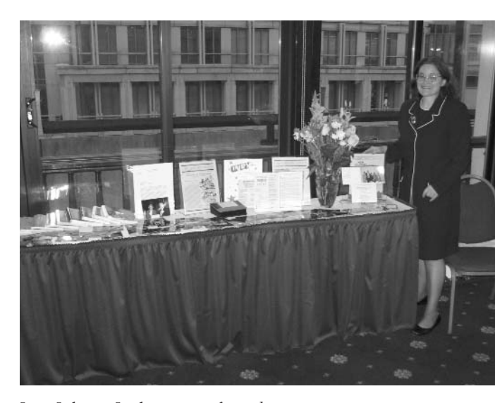
Law Library Lights covers from the past